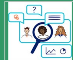
2023 to Date