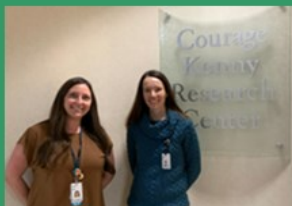
Research Therapist 2024