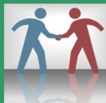
Research Meets Practice